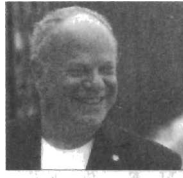
Martin E. P. Seligman, Ph.D.